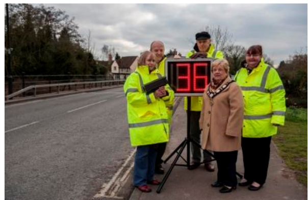
Community SpeedWatch volunteers