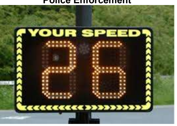
Parish/Town Council purchased SID