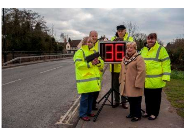
Community SpeedWatch volunteers