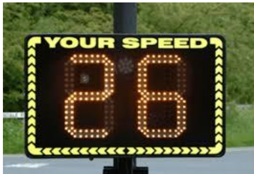
Parish/Town Council purchased SID