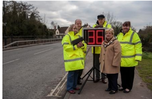
Community SpeedWatch volunteers