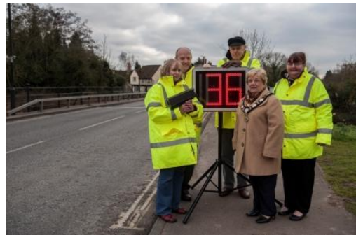
Community SpeedWatch volunteers